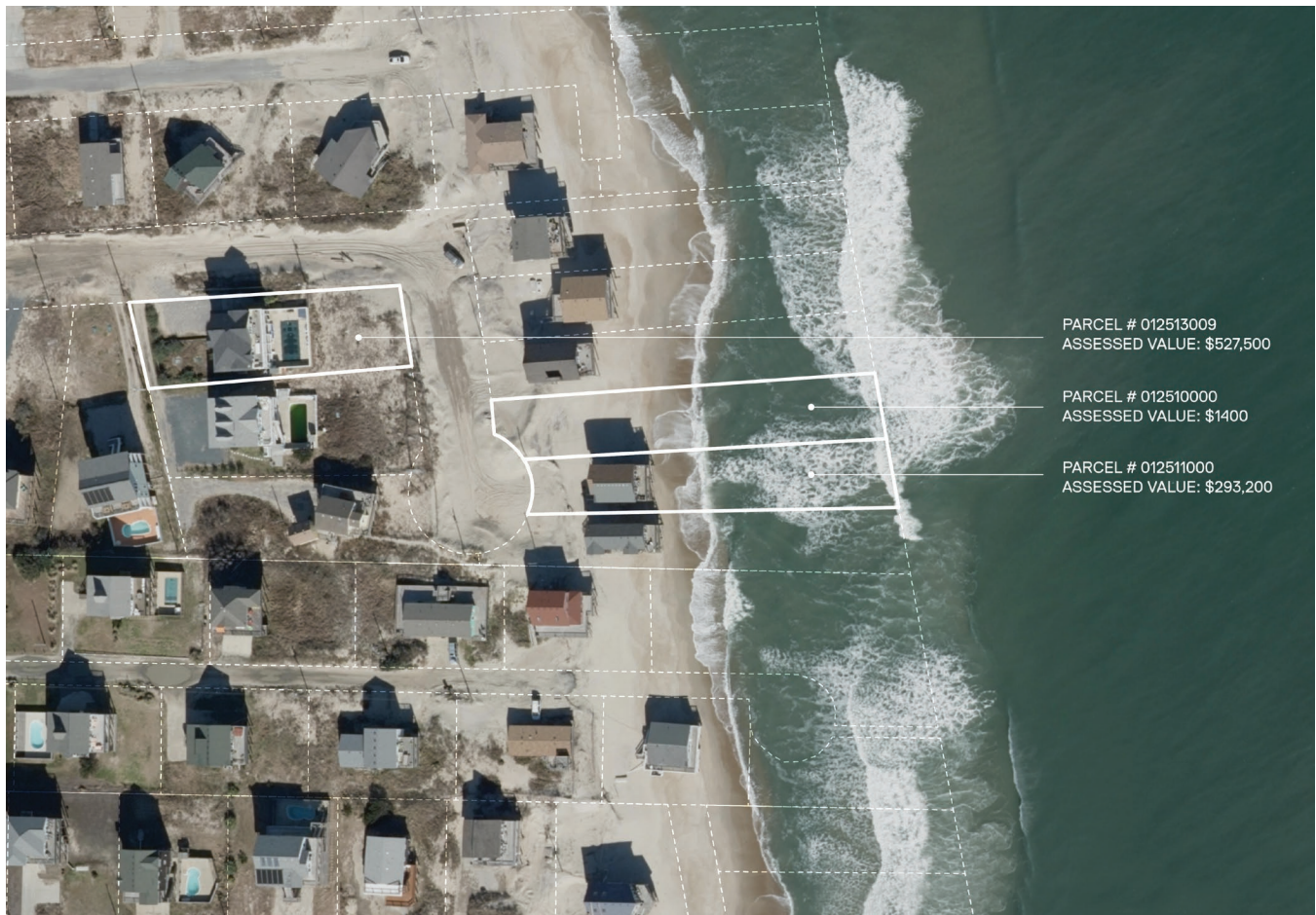
Figure 4. Property Assessment of Coastal Parcels.

In lieu of broad legislation or judicial decisions, lawmakers in coastal states have turned towards other avenues of regulation for sea level rise. In North Carolina, for example, the state passed a law limiting the adoption of sea level rise projections on land use regulations. Fearing the threat of decreased economic activity in coastal municipalities, the state sought to unbar development in vulnerable areas and ignore the apparent risks. 13 In contrast, New Jersey initiated a program called “Blue Acres” which funds voluntary property acquisitions in floodplains and flood prone areas and converts private property to public conservation and recreation areas. 14 Up and down the coast, there are a gradient of approaches, but these disparate responses form a patchy set of regulations.